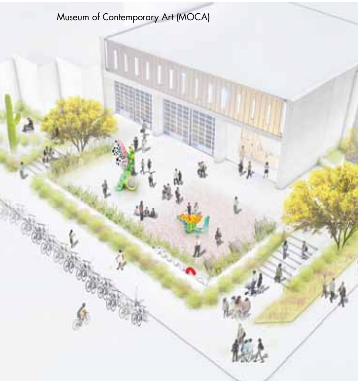
Museum of Contemporary Art (MOCA)